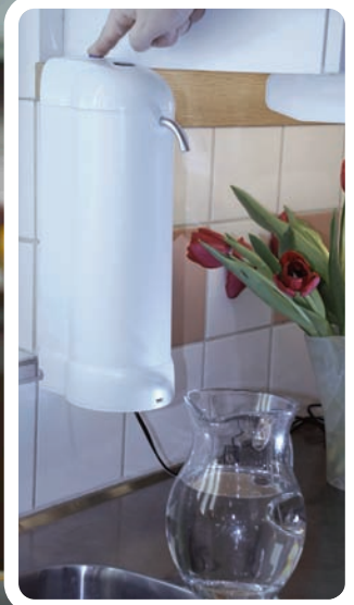
Attach to the wall...